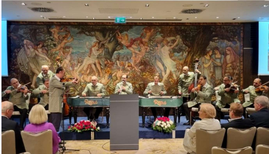
The Rajkó Ensemble.