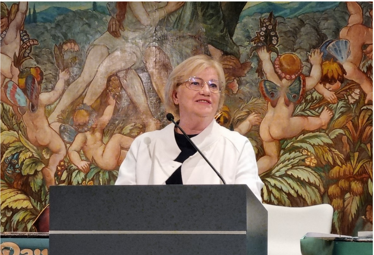
Katalin Szili.

and a presentation of the past activities and achievements of the foundation, with special focus on charity and education. They reiterated their goal, according to which the Americans for Hungarians Foundation and its American-Hungarian Club were started to bring together the best resources of America and Hungary in order to improve relations between the two countries, and to contribute to Hungary's economic revival. Through networking, partnering, investment, cultural and knowledge exchange, they strive to be a bridge between the United States and Hungary.