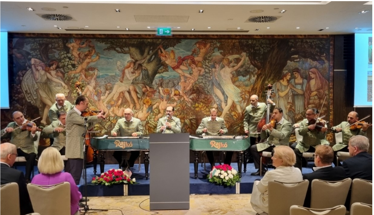
The Rajkó Ensemble.